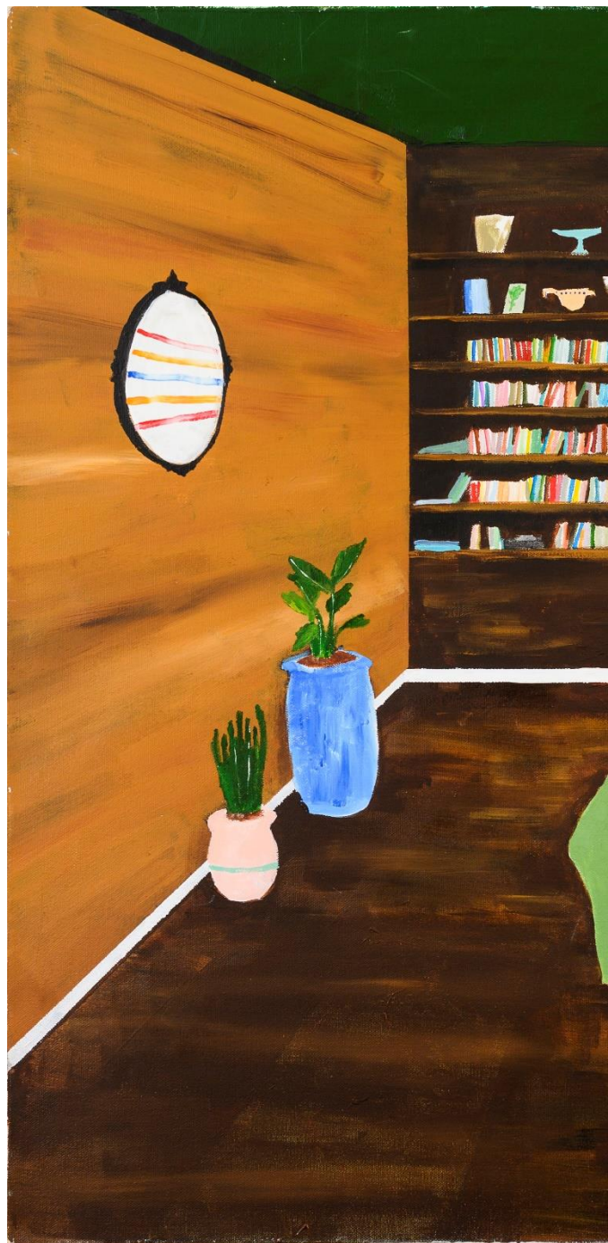
Den, 2017 Acrílico sobre lienzo 76.2 x 101.6 cm