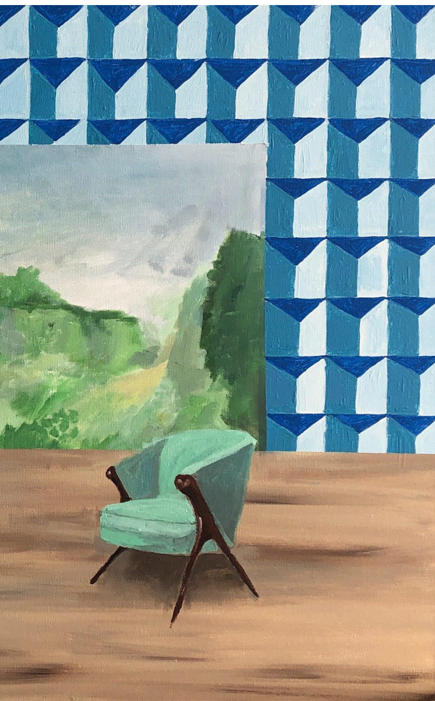
er Chairs, 2018