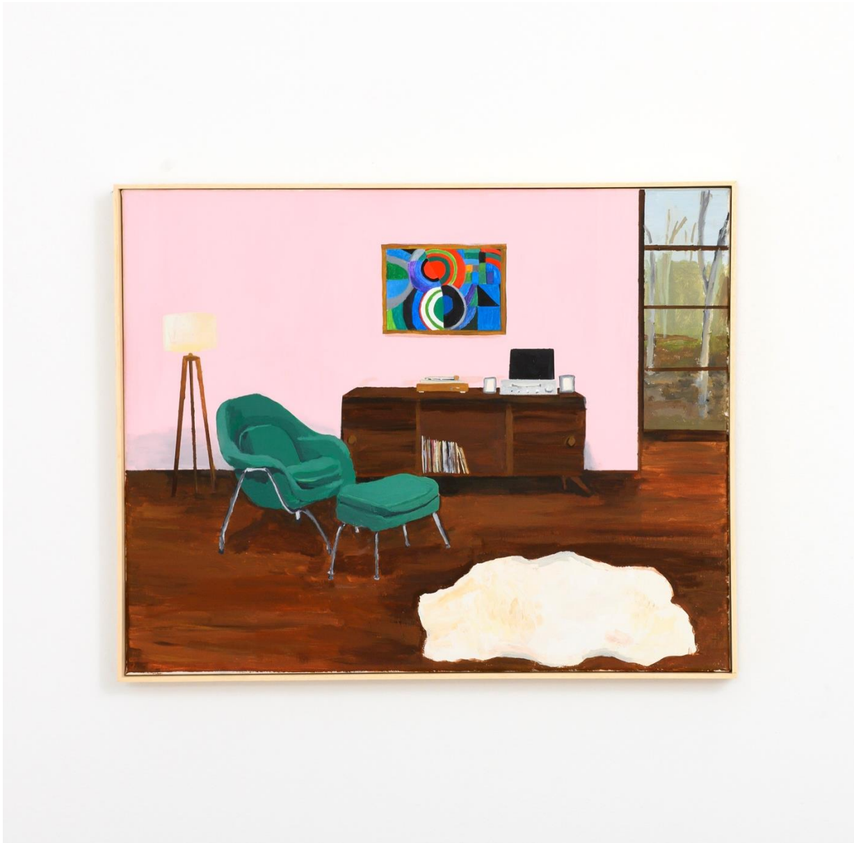
Room with Faux Sheepskin Rug, 2019