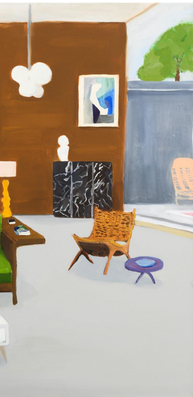
Large Ranch, 2020 Óleo sobre lienzo 76.2 x 101.6 cm