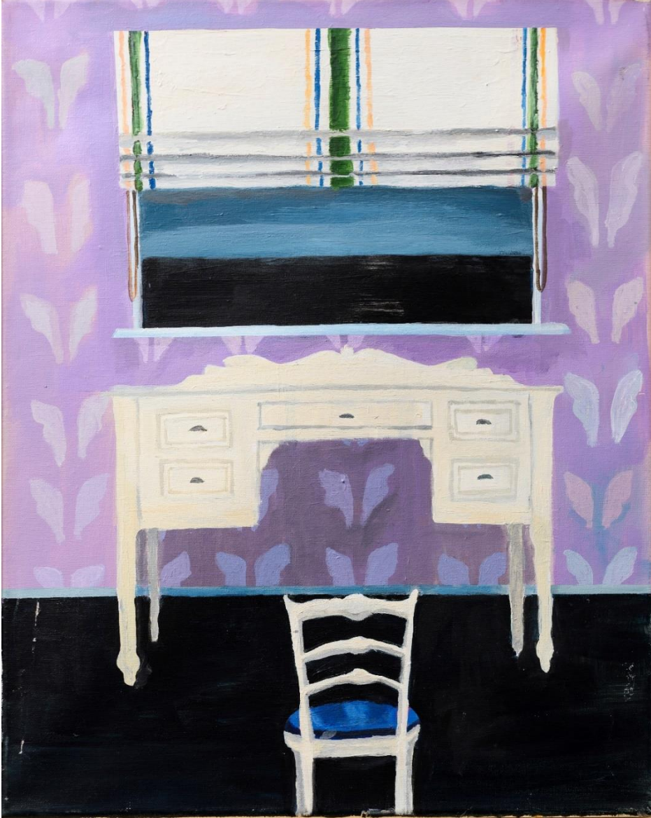
Desk with Lake View, 2018