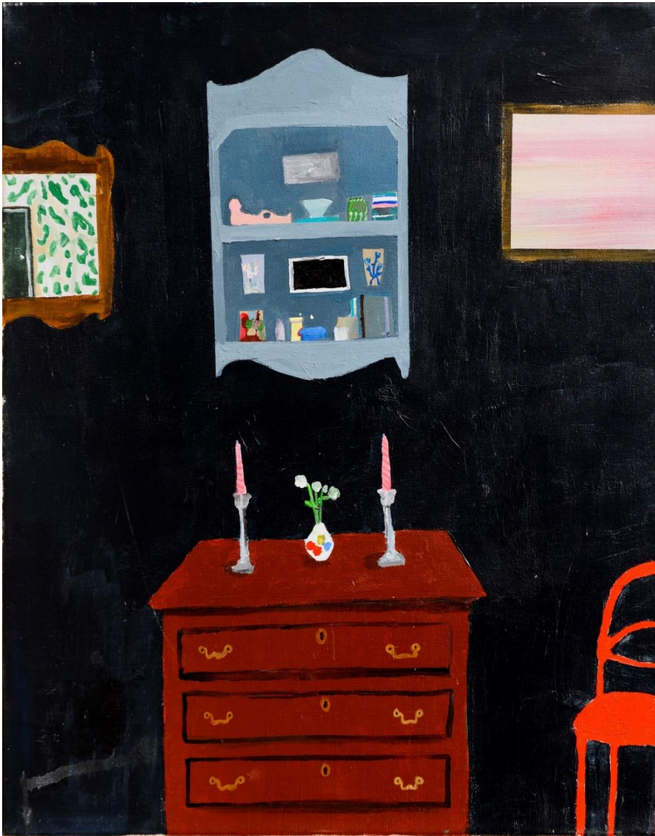
Cabinet in Hallway, 2017