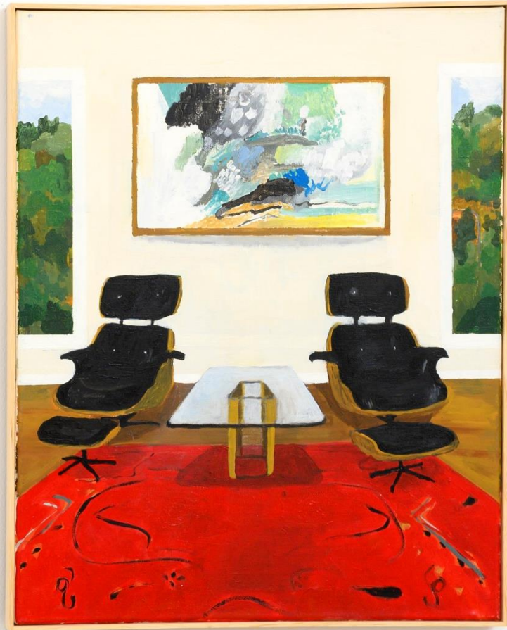
Twin Loungers , 2019